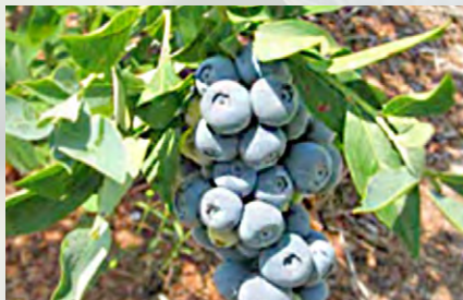
Variety: 'KREWER' TM

Ripening dates are average for the Western Oregon area. Ripening will vary with locations and season, but the relative ripening periods between varieties should remain the same.