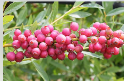
Variety: 'PINK LEMONADE'