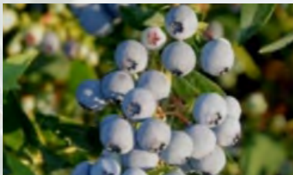
Variety: 'MINI BLUES'

Ripening dates are average for the Western Oregon area. Ripening will vary with locations and season, but the relative ripening periods between varieties should remain the same.